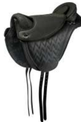
650010 Western Treeless Saddle